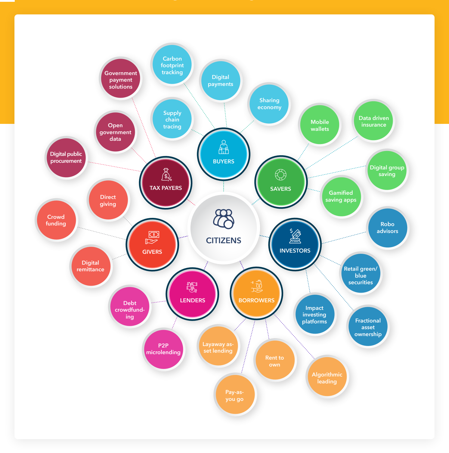
Exhibit 2: Citizens and digital financing of the SDGs

Digitalization is already enabling many individuals and small businesses to gain access to financial services, and we are seeing early signs of broader dimensions of digitally enabled financing of the SDG,<sup>30</sup> as highlighted in Exhibit 3.