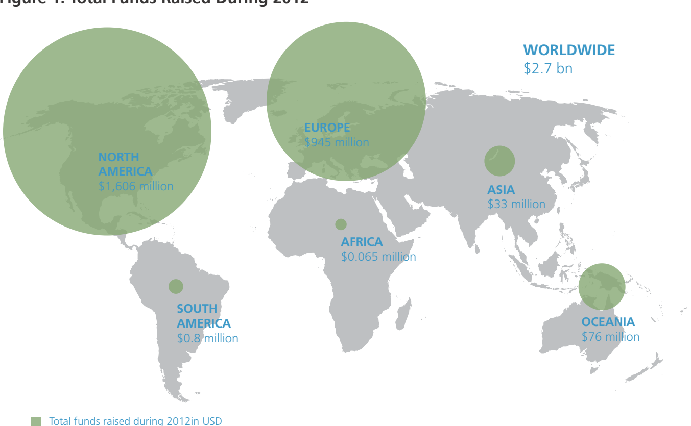
Figure 1: Total Funds Raised During 2012

Crowdfunding refers to any kind of capital formation where both funding needs and funding purposes are communicated broadly, via an open call, in a forum where the call can be evaluated by a large group of individuals. It is an Internet-enabled way for businesses and/or other organizations to raise money for their projects or for financial capital in the range of US$1,000 to US$1 million. Projections for the size of the crowd-funding investing market vary broadly from US$3.98 billion to US$300 billion.<sup>9</sup> While lending-based crowdfunding grew 111 percent to US$1.2 billion, equity-based crowdfunding is still rather small with growth rates of 30 percent to US$116 million<sup>10</sup> (see also Figure 1 below).<sup>11</sup> Crowdfunding has four subcategories: Donation or presales